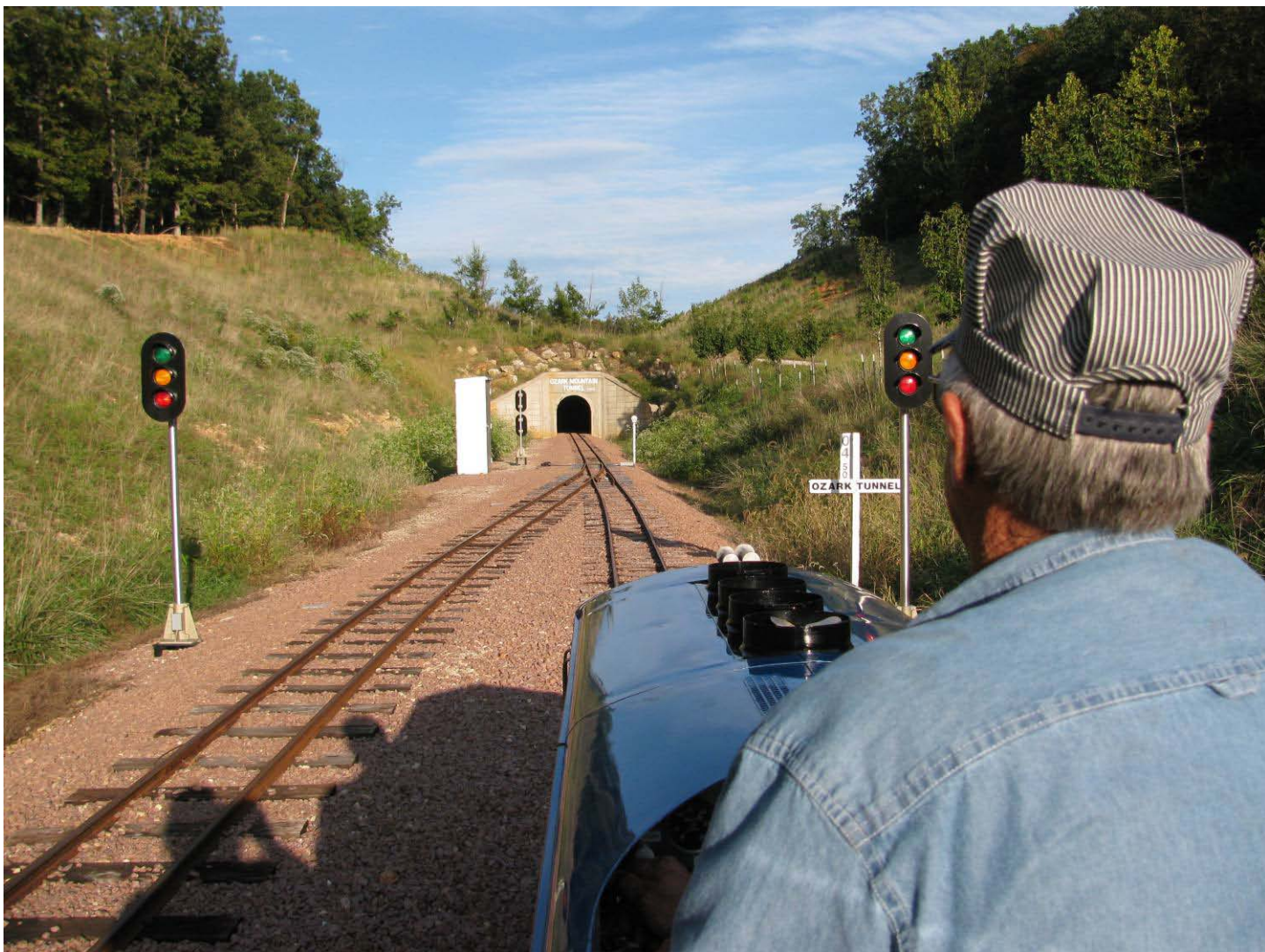
The Ozark Mountain Tunnel portal looms ahead as George stretches #824's legs uphill on the highball