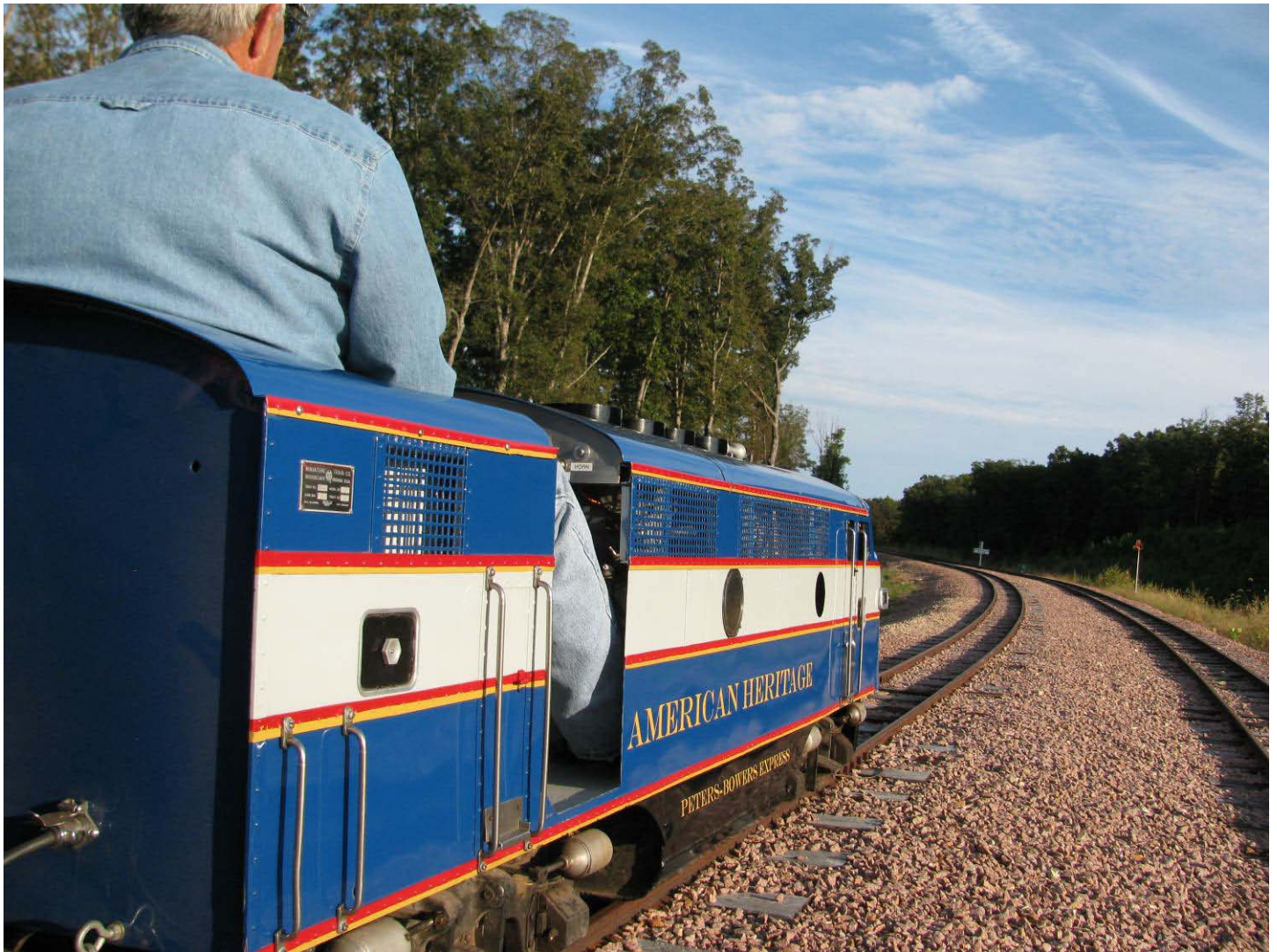
Heading up smoothly toward Arborway, the bright sun and azure sky blend the #824 with the scenery