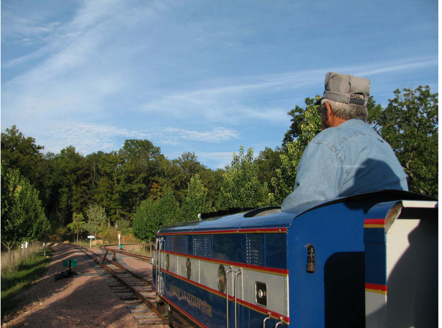
Slowing as we approach the Woods Valley Cut-Off