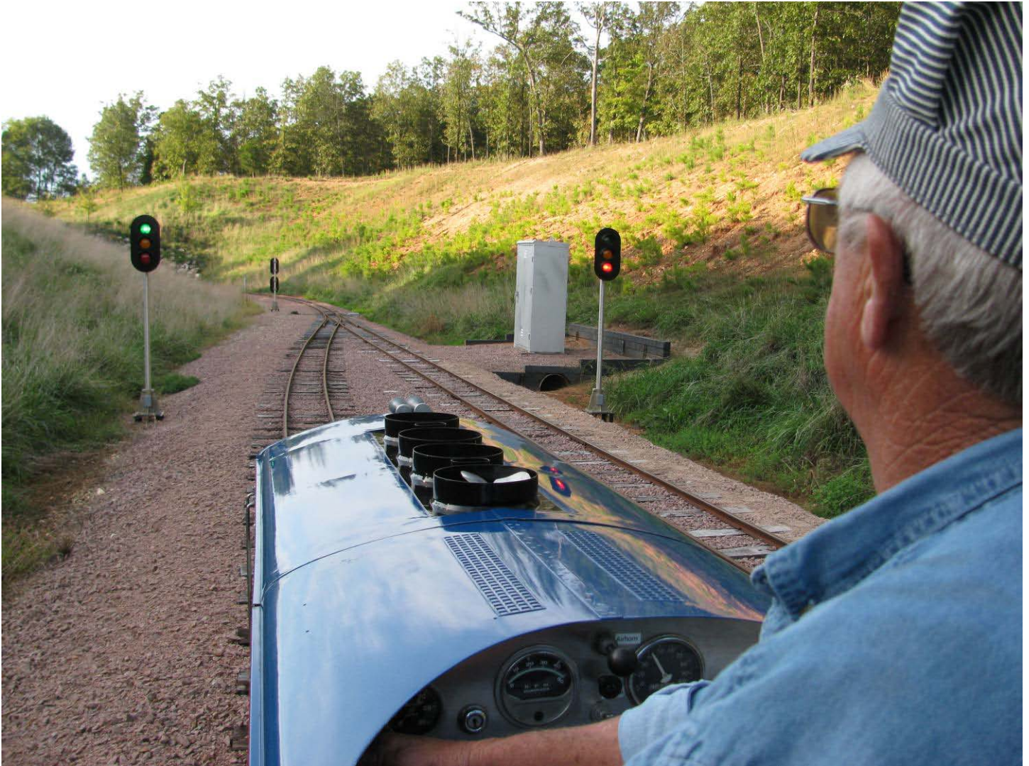
Approaching the signals at Ozark Mountain Tunnel West on the down-bound track