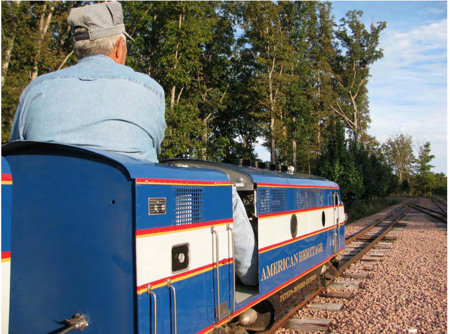
Approaching the lower end of Arborway, George gets ready to throttle down for the East Sub