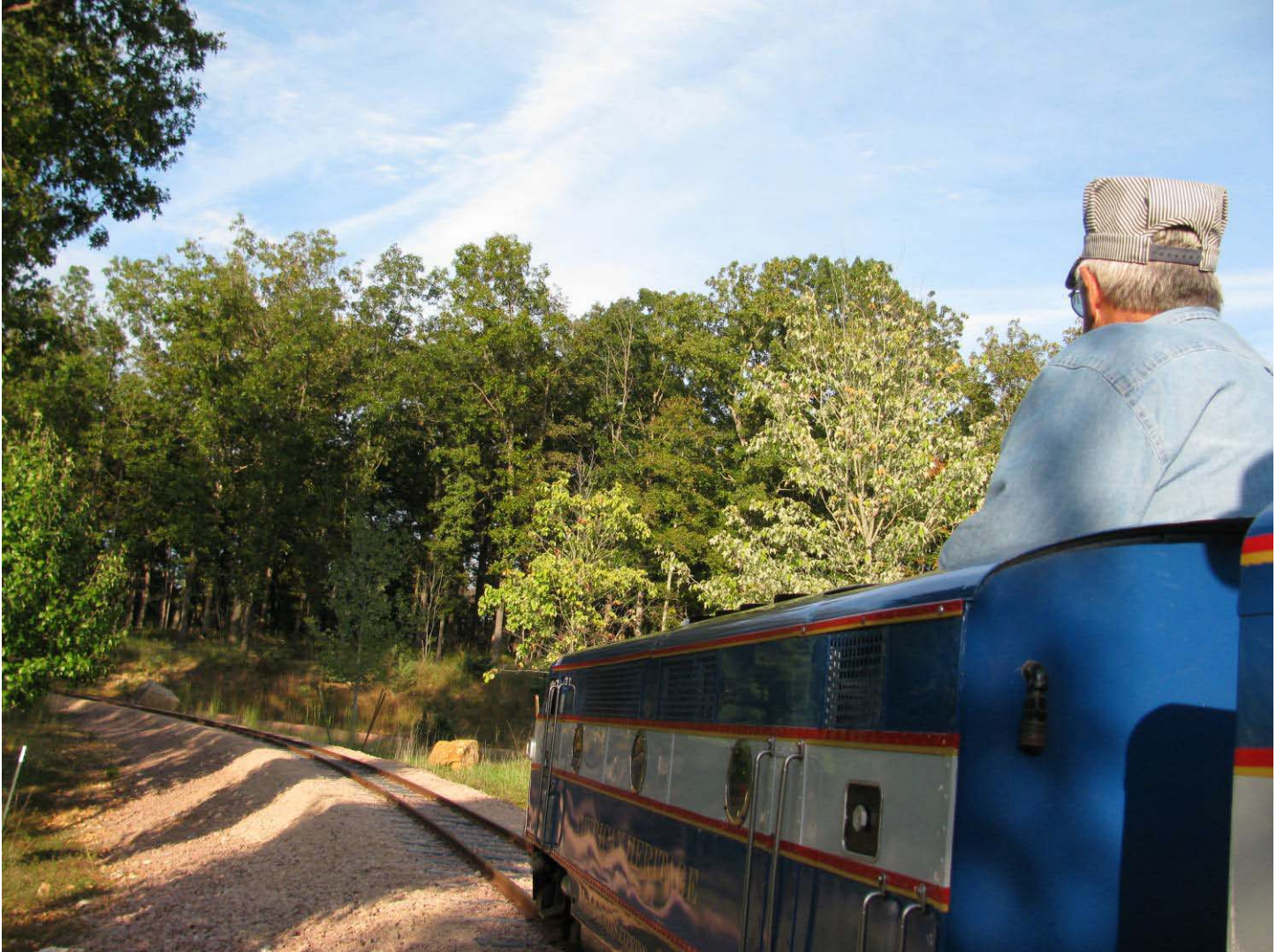
Entering the Woods Valley Cut-Off toward home