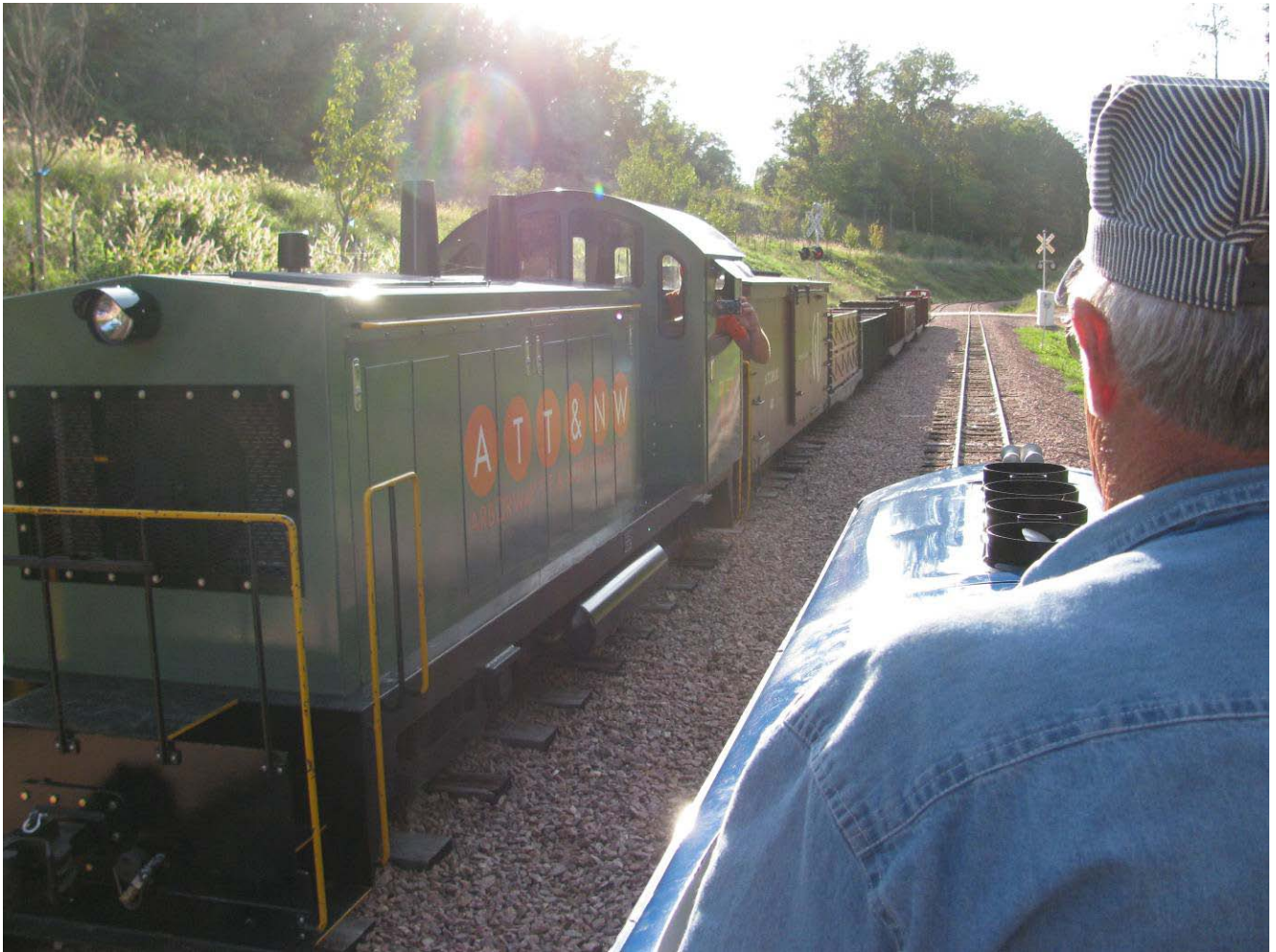
Another meet: this time with the waiting #17 as we pass by on our approach to Miller Gate Crossing