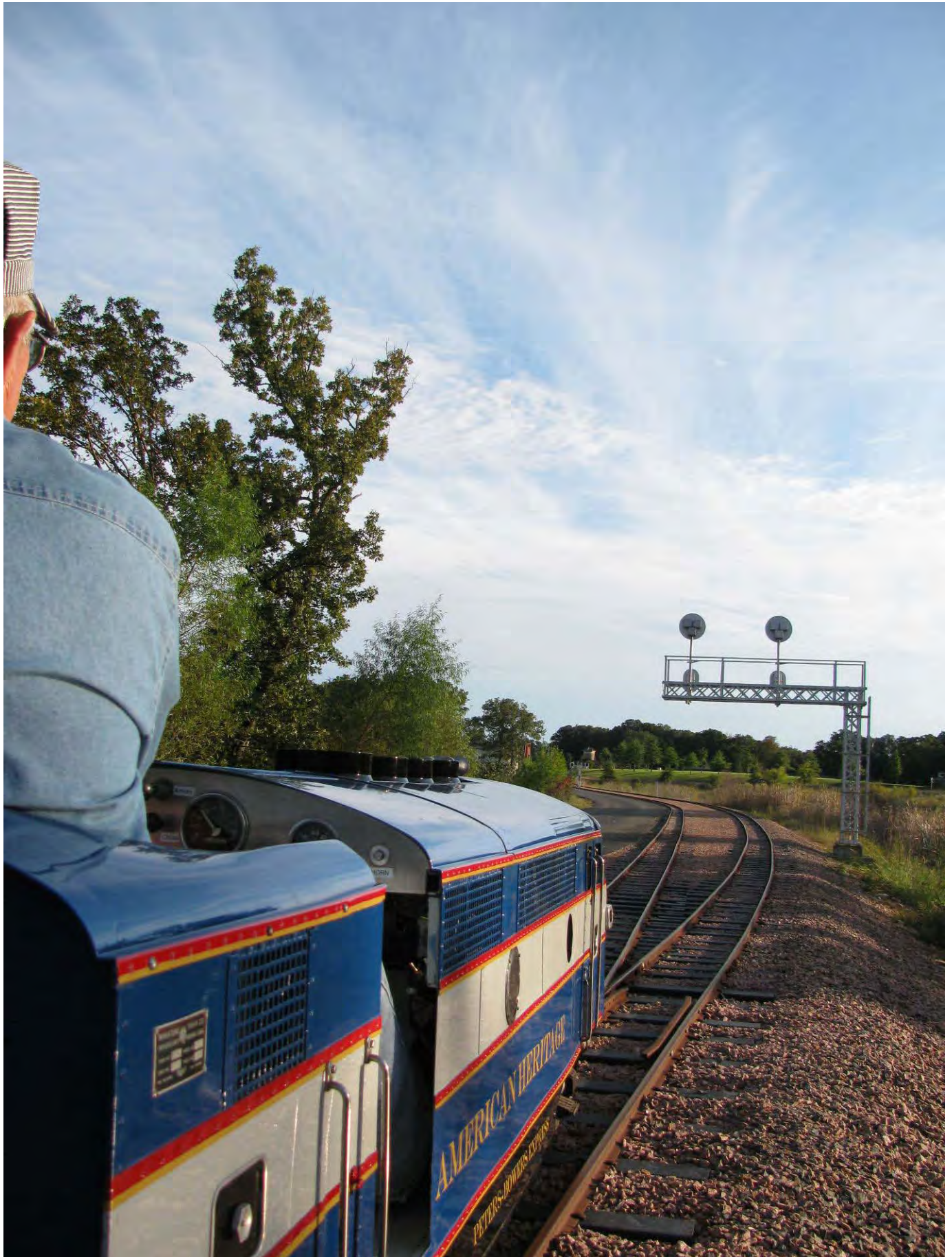
Almost home, George noses Train #824 smoothly onto Track #2 for the ride past Lakeside to the Station