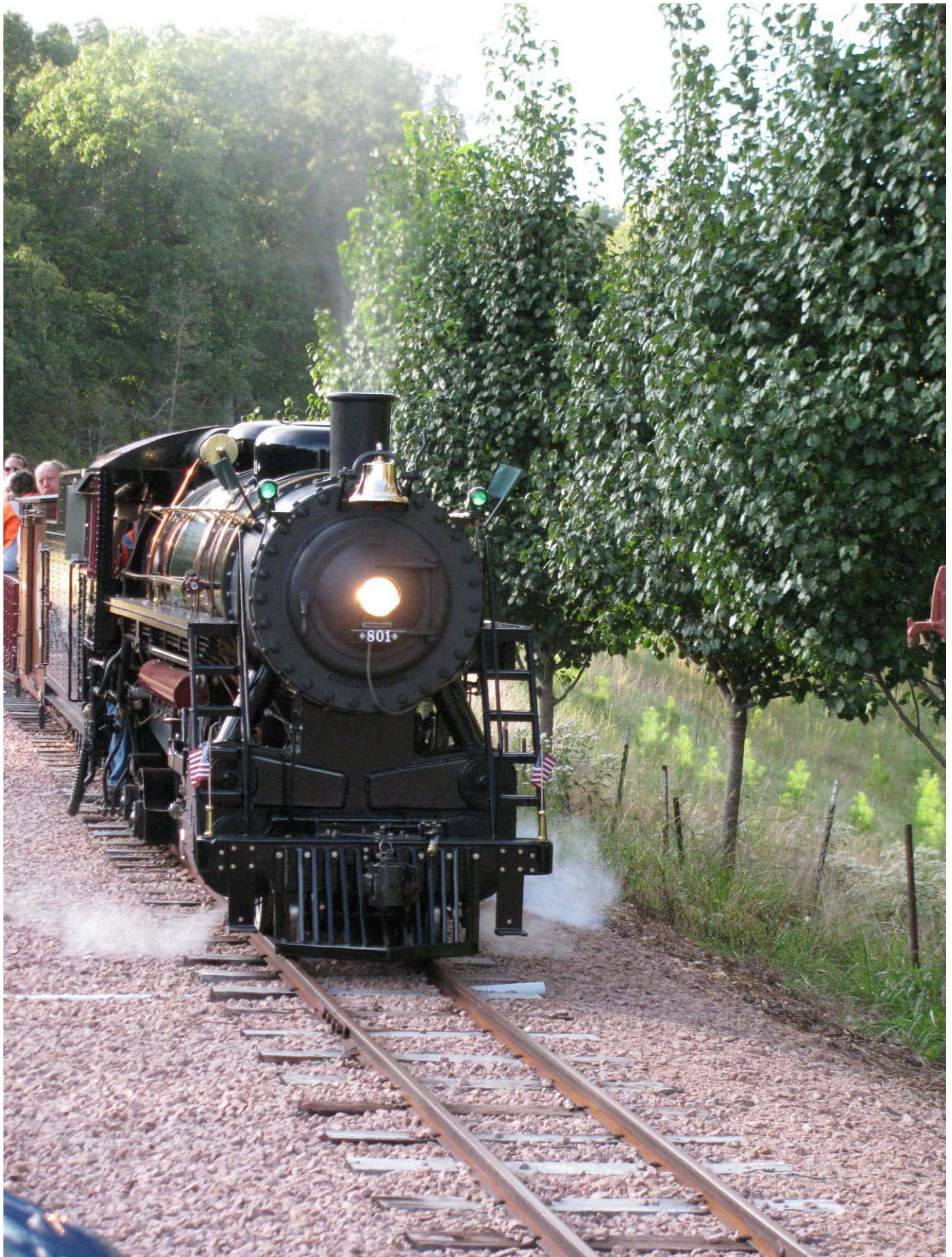
We meet with the #801 at Arborway