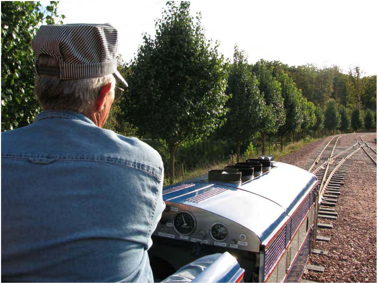
Starting to open the throttle while running smoothly through Arborway in the brilliant sunshine