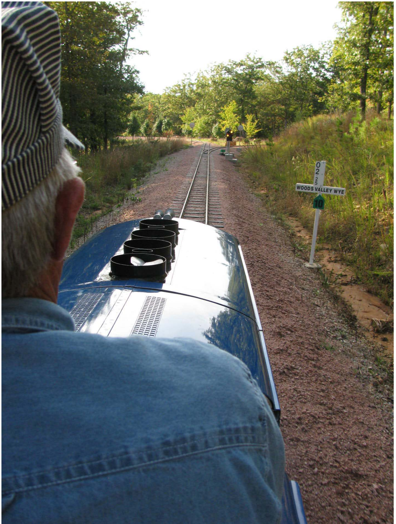
Approaching the CPL signal to the Upper Loop at Woods Valley Wye